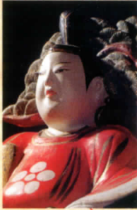
Tenjin-sama Matsui Tenjin (Hiroshima Pref.)