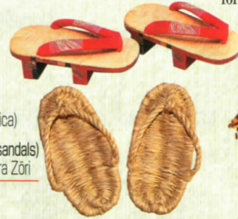
Geta and Zōri (Japanese sandals) Omote-tsuki Geta and Wara Zōri

(1st and 2nd Exhibition Rooms) (Collection of 2,266 items officially designated as important tangible folk cultural properties)