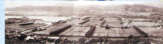
Salt Industry (circa 1955)