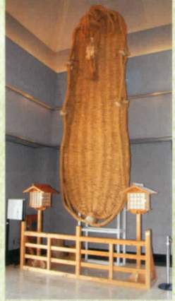
Hōnō Ōzori (5.25 meters)