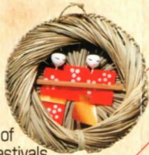
Celebration of Seasonal Festivals Nagashibina Dolls (Tottori Pref.)