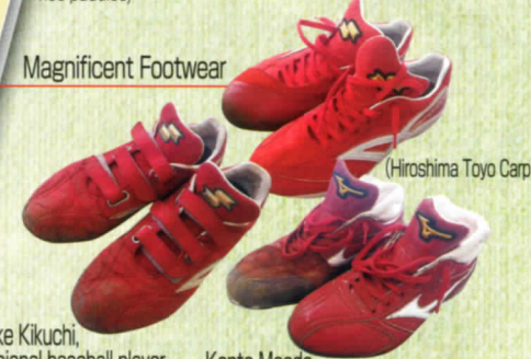
Ryōsuke Kikuchi, professional baseball player Uniform No. 33 / Infielder