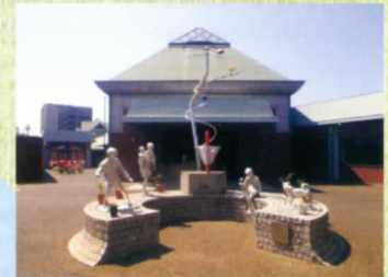
Monument "Yūyū" by Takanori Matsuoka

Tradition and warmth handed down around various regions (3rd to 7th Exhibition Rooms) On display are toys made with the wishes and prayers of the people of each respective region, symbolizing the spirit of each region's people.