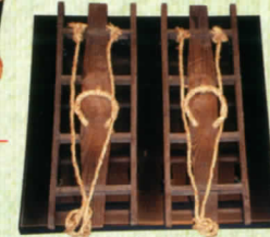
Labor and Footwear Ōashi (Variety of geta worn in rice paddies)