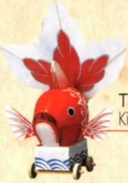
Hometown Toys Tsuneishi Hariko (Fabrication technique designated as a Fukuyama City intangible cultural property)