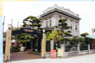
Old Maruyama Store Office National registered tangible cultural property